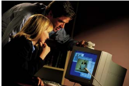
Monitor your business anytime, anywhere