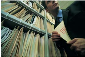
Protect sensitive corporate information