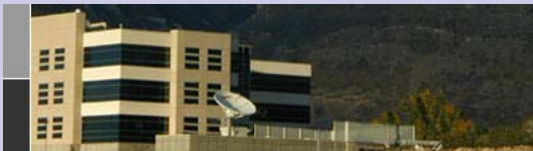
The Atvantage Data Center in Lindon, Utah